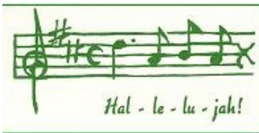
Artwork by F.G. Bulber 1976