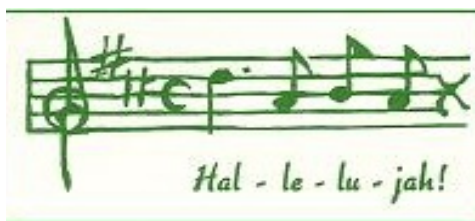
Artwork by F.G. Bulber 1976